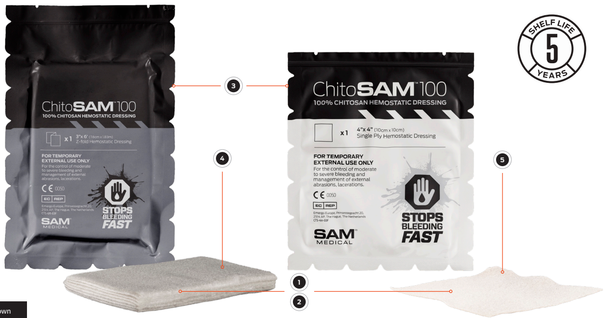
*CE versions shown